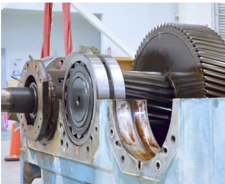
Helical gearbox refurbishment in the Chile Service Center