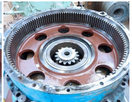
Planetary gearbox refurbishment in the Australia Service Center